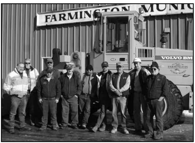
Farmington Public Works Department

HELPFUL HINTS - If you are clearing the end of the driveway, put the removed snow on the side of your driveway opposite the direction from which the plow is coming. The plow will carry the snow away from your driveway. Otherwise, the snow will again fill your driveway entrance. Keeping a space clear before your driveway or walk minimizes the amount of snow falling into your driveway or walk. If possible, wait until the highway has been plowed before cleaning out the end of your driveway or walk. There is no practical way to plow the highway without depositing snow into your driveway. Please understand the Town of Farmington is required by law to keep roads and sidewalks plowed and sanded.